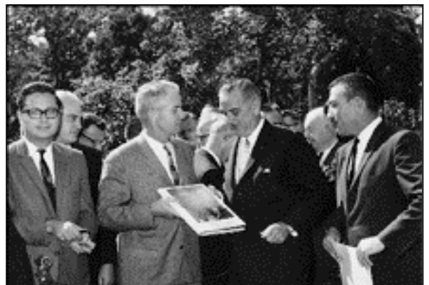
David Brower thanks President Lyndon Johnson for signing the Wilderness Act

Young people directing projects and initiatives are already leaders of uncommon talent and passion. Earth Island provides its award winners with opportunities to expand their leadership through media interviews, speaking engagements, and meetings with peers and mentors in their areas of interest. In addition to the award and ceremony week training, winners are introduced to potential sources of funds and skills training appropriate to their work.